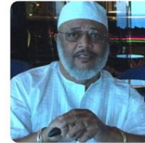
Wade W. Nobles ABPsi Pan African Black Psychology Global Initiative